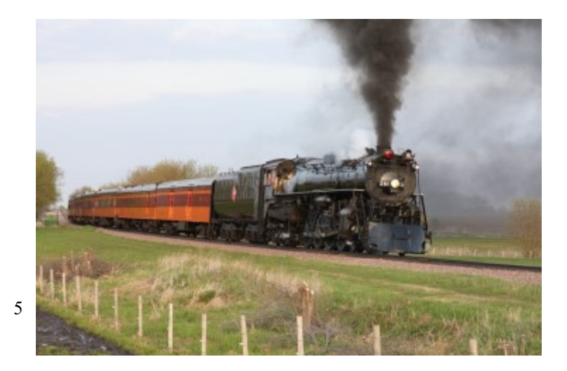
Photo Run-bys are said to be a part of both Saturday and Sunday trips. For more information www.261.com

Sunday October 9th - Train will depart from Minneapolis Junction at 9:00am westbound on the Twin Cities and Western. At Young America, MN the train will turn south on the former Minneapolis and St Louis RR tracks to Winthrop or Gibbon for some very rare mileage running. There is no place to turn the train so a diesel will pull the train back to Minneapolis.