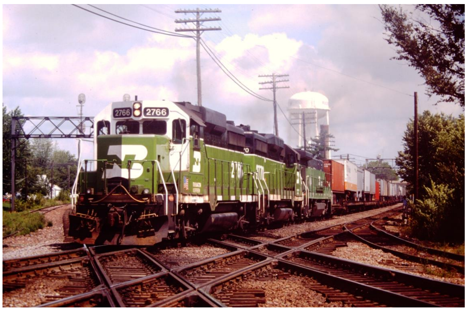
BN #2766 GP39E, rebuilt GP30 leads a piggyback train across the diamonds at Rochelle, IL. The photo was taken August 20, 1994. This would have been before the Union Pacific acquired the C&NW. It was also several years before the Rochelle Railfan Shelter was built.

Visit the Chapter Webpage www.nrhswis.org