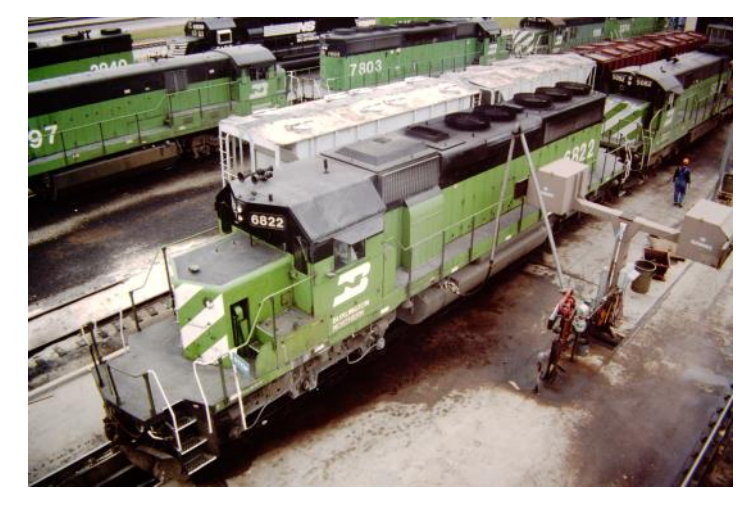
BN activity in the yard at Galesburg, IL in the early 1990's.

Sneak Peek at January 6th 2017 Presentation BN in Illinois