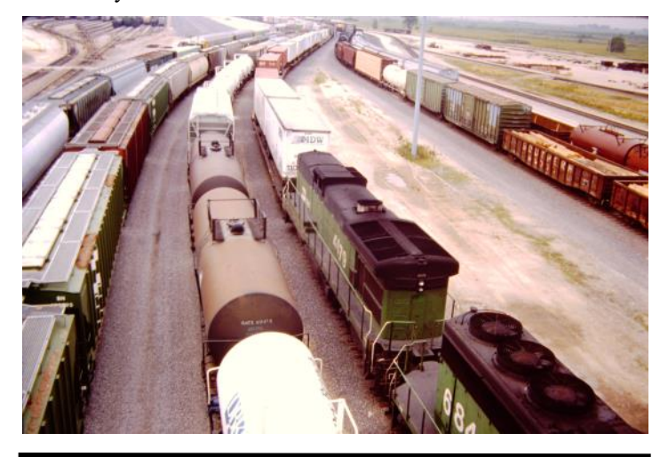
Gone But Not Forgotten - January 20, 1963