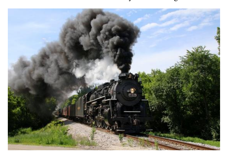
NKP #765 Eastbound at Richmond IL on Sunday June 12, 2016 on WSOR tracks.

The Fort Wayne Railroad Historical Society is bringing the Nickel Plate #765 2-8-4 Steam Berkshire back to Chicago in 2017. The #765 will be pulling a total of 4 excursions on the weekend of June 17-18, 2017. All 4 excursions will depart from LaSalle Street Station and steam to Joliet, IL and then return. The #765 will lead the train westbound and a Metra diesel will pull the train back to Chicago. The trips will feature a photo run-by, open vestibules, entertainment, historical reenactors and more. There will also be catered appetizers and special drinks available. There are several levels of accommodations available. The trips on June 17th will leave LaSalle St Station at 9:30am and 3:30pm. On June 18th the train will depart at 9:00am and 2:30pm. For more information or to purchase tickets check out www.fortwaynerailroad.org.