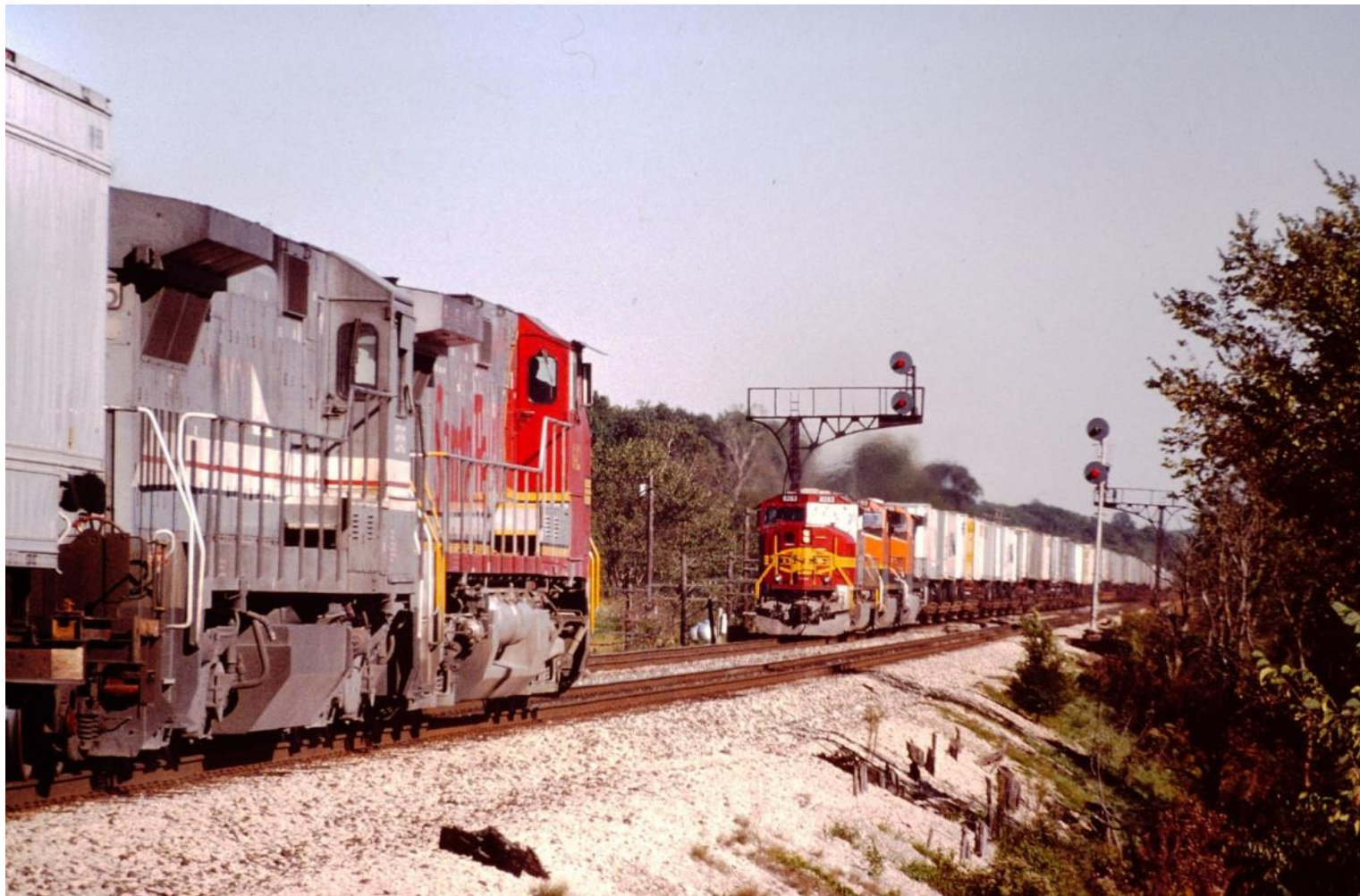
Two “Hot” Santa Fe trains about to meet at East Galesburg, IL. These trains are on the Santa Fe mainline now the BNSF. The “transcon” is a very busy mainline with doublestack trains and piggyback trains.

Our purpose as members of Wisconsin Chapter—National Railway Historical Society is to gather, preserve and disseminate information, both historic and current, pertaining to railroading in Wisconsin and the Upper Midwest.