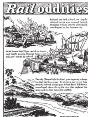
Official Guide of the Railways, September, 1956