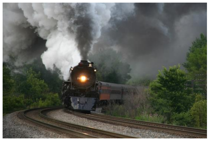
Milw #261 at Waterford Ave on a visit to Milwaukee. #261 is headed south to Sturtevant to turn on the wye track.