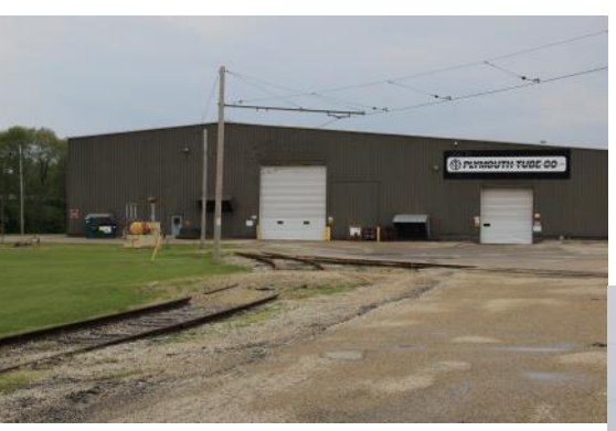
Trent Tube Siding trackage taken in May 2015.