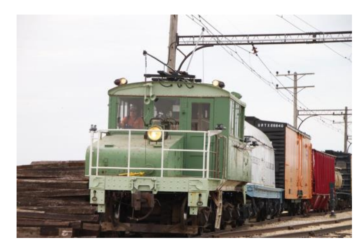
TMER&L #L4 in action in 2014 at IRM