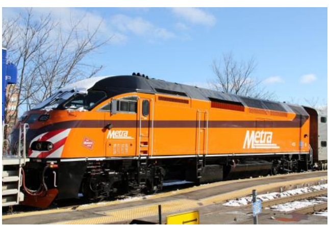
Newly Painted METRA Units in Elgin, IL January 13 2019