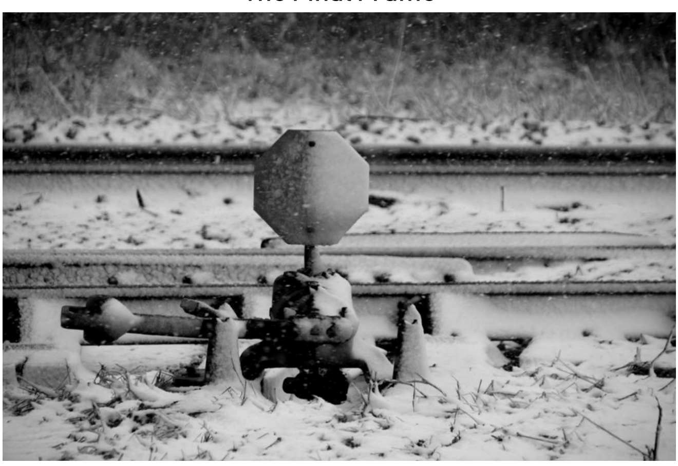
A switchstand show an accumulation of snow from an April 14, 2019 snowstorm.