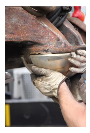
Photos by Tom Sharrat showing the Electroliner getting put back onto its original trucks