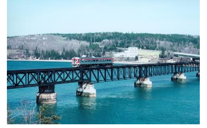
Above CP Rail Budd RDC-1 #9049 crosses the Bear River Bridge near Digby, Nova Scotia on Dominion Atlantic Railway Train #1 on May 6, 1976. Sadly, the DAR is gone now and the railroad here torn up.