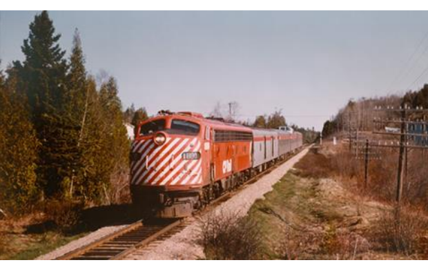
CP Rail EMD E8A #1800 leads the Montreal-St. John, NB "Atlantic" on the outskirts of Saint John, New Brunswick in May, 1976.