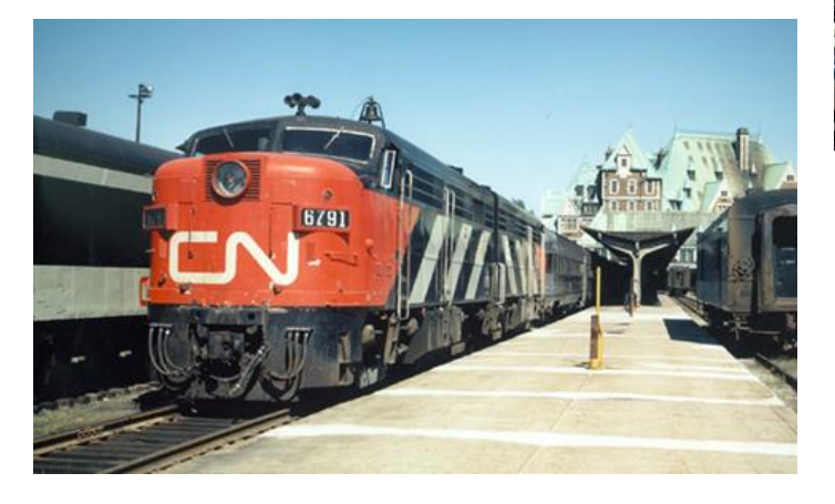
Below CN MLW FPA-4 #6791 awaits its departure for Montreal as Train #25 on June 14, 1970. The equipment is the former Reading CRUSADER equipment, purchased by CN and remodeled as its CHAMPLAIN.