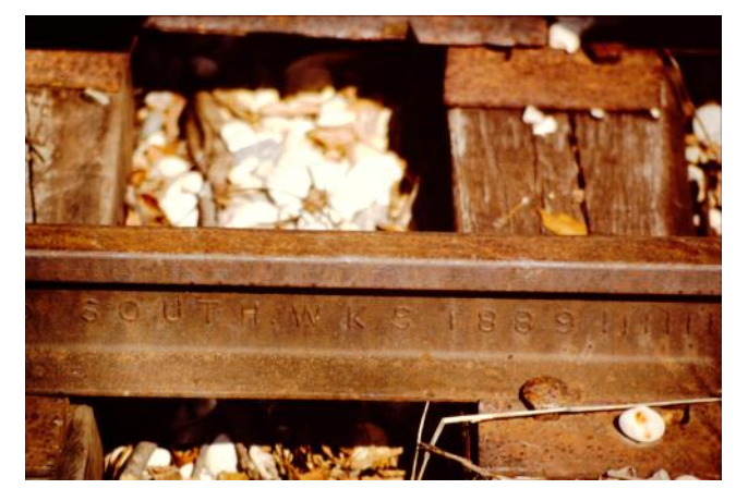
The final photo shows yet another important message to be found on the sides of some rail!

A piece of rail I found at the old Kettle Moraine Scenic Railway, a former Milwaukee Road branch line, was rolled by the South Works in June of 1889. The South Works was a mill founded in 1857 in Chicago and became part of Illinois Steel in that very year, 1889. By 1901 it was controlled by US Steel. At one time this 600 acre mill site employed 20,000. It closed in 1992.