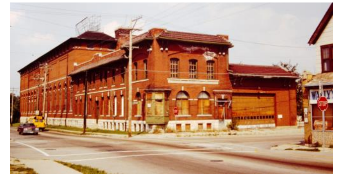
trainman's room and, evidently, passenger waiting areas at the corner of 84th and Lapham, with a car barn east of the train-

Remember The Milwaukee Electric Railway and Light Company's old West Allis "car barn" (more properly called the West Allis Station) at 84th and Lapham? It was a majestic example of industrial architecture, and an ornate specimen of the bricklayer's art. I took these photographs in 1981. When constructed in 1904 for the TM it was an electric substation to the north end, a