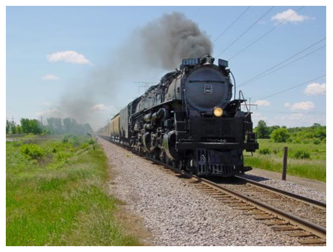
UP #3985 northbound at Kenosha WI in June 2002