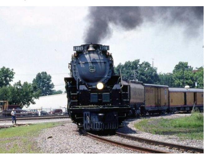
UP #3985 shows off articulation at Dupo IL in June 2001.