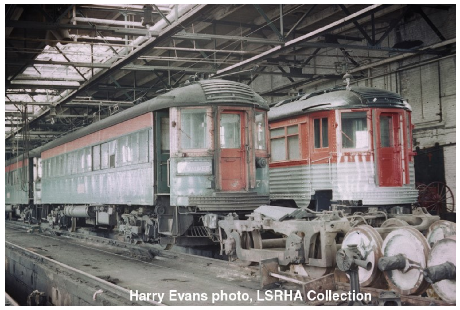
North Shore Cars in the Harrison Street Shops in Milwaukee, WI

Preserving Wisconsin Railroad History for 73 Years