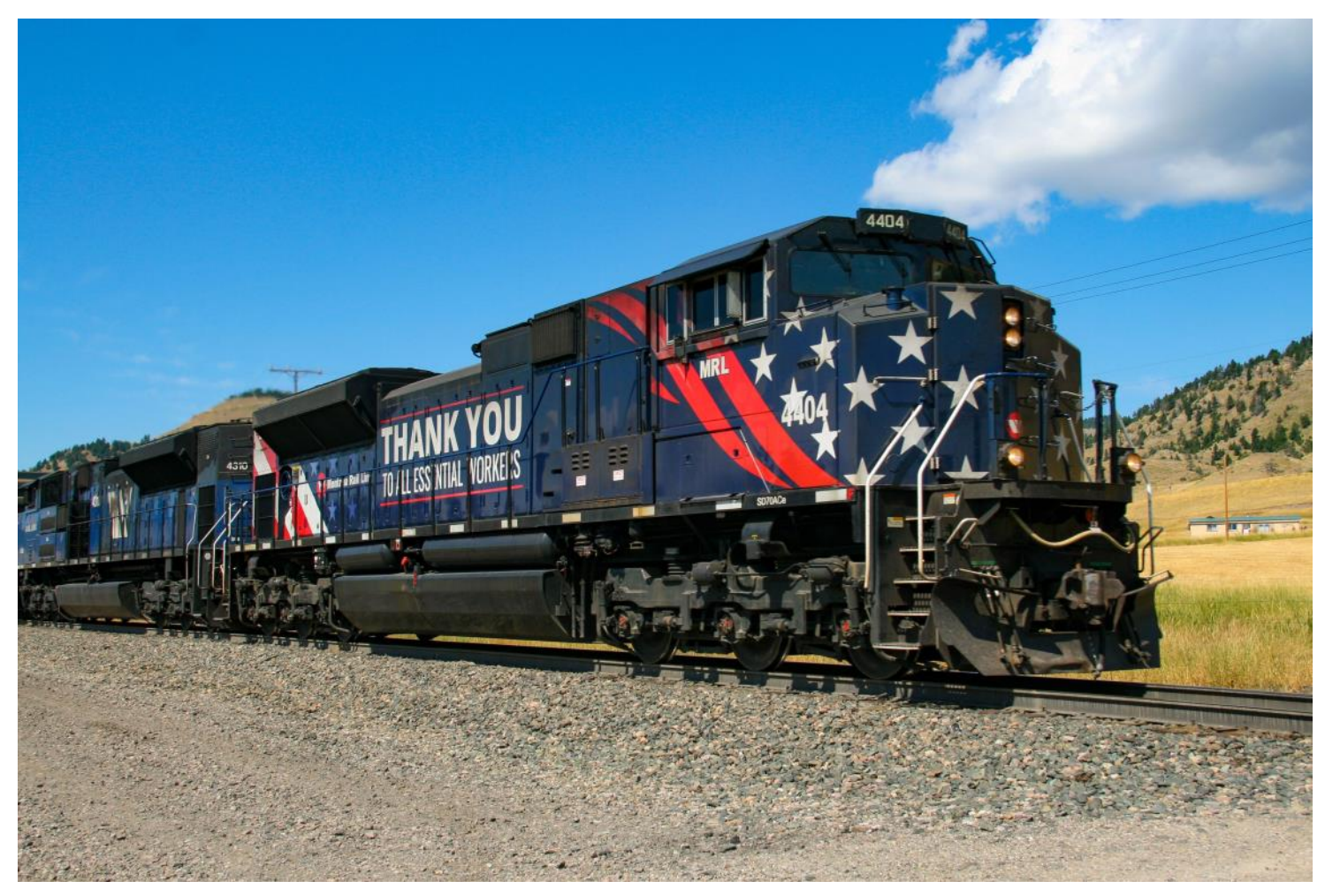
Montana Rail Line #4404 Thank You to Essential Workers SD70ACe leads a MRL train eastbound at Flynn Creek Road near Livingston MT on August 23 2022.

Visit the Chapter Webpage www.nrhswis.org