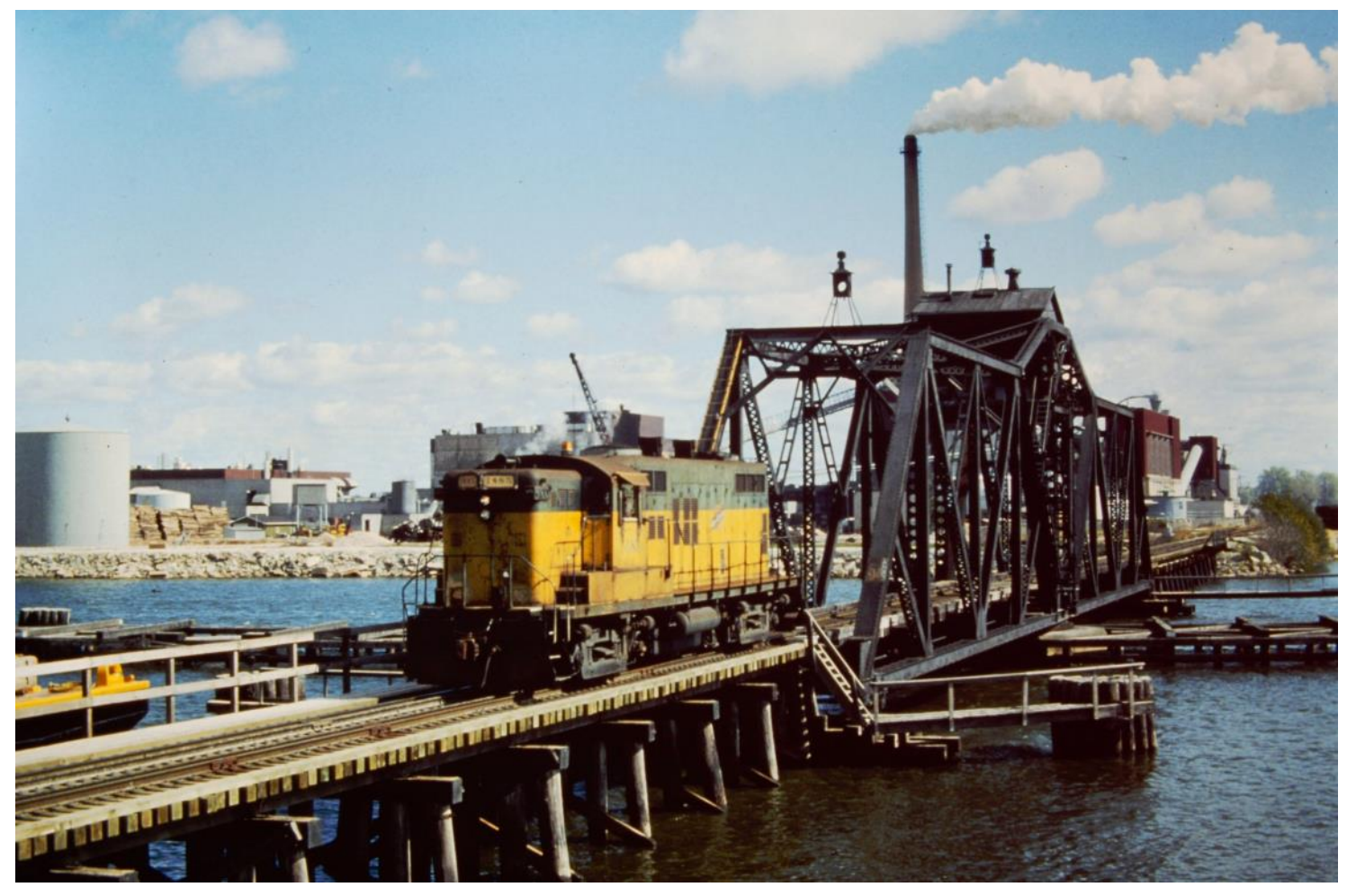
CNW #1485 a AS-16M Baldwin EMD Hybrid crosses the bridge in Green Bay WI.

Visit the Chapter Webpage www.nrhswis.org