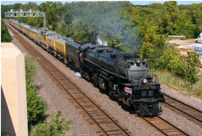
Wheaton IL on the Geneva Subdivision