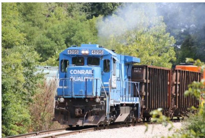
Ohio Central #4096 a Super 7 leads a local train near Zaynesville OH. In full Conrail paint this might be a former Monongahela railroad unit.