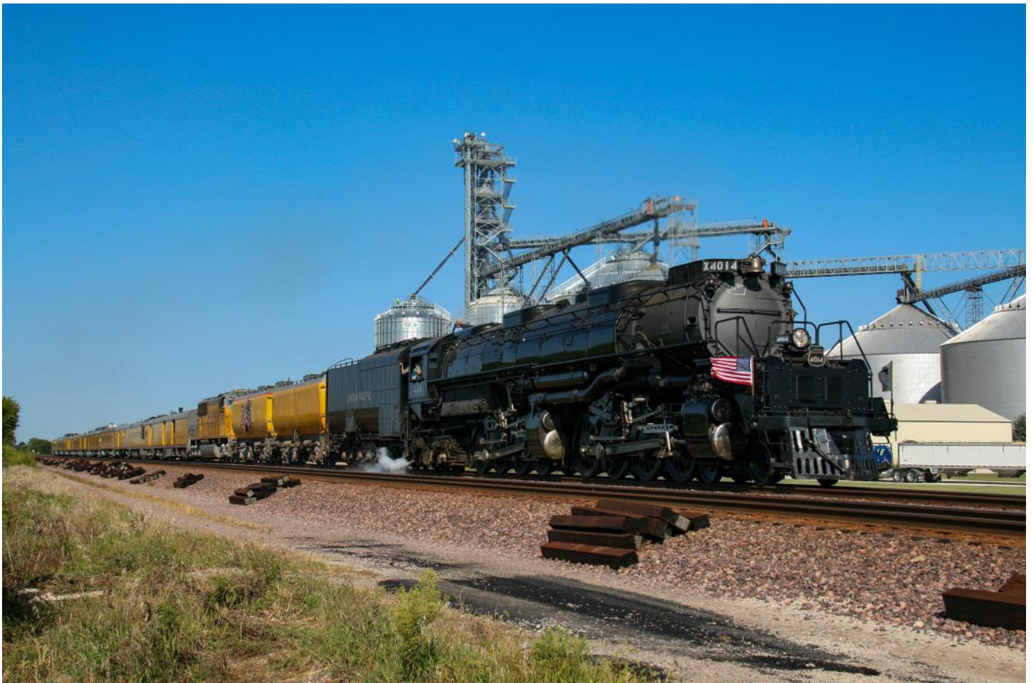
UP #4014 "Big Boy" leads the "Heartland of America Tour" train eastbound at Meredith IL on the Geneva Subdivision September 9 2024

Visit the Chapter Webpage www.nrhswis.org