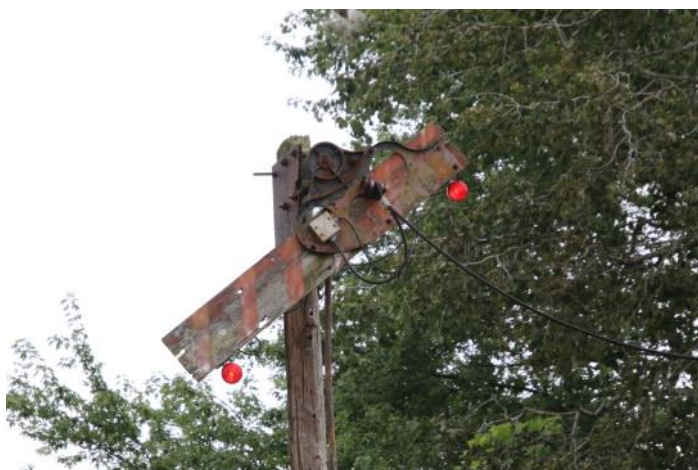
A classic "tilt board" signal protects a diamond between RJ Corman and Wheeling & Lake Erie outside of Brewster OH