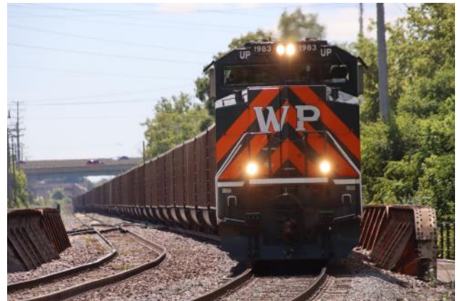
Rounding the curve crossing over Capitol Drive about the enter Butler Yard.

Working hard climbing the .8% grade through West Allis. It was just two locomotives on the loaded train.