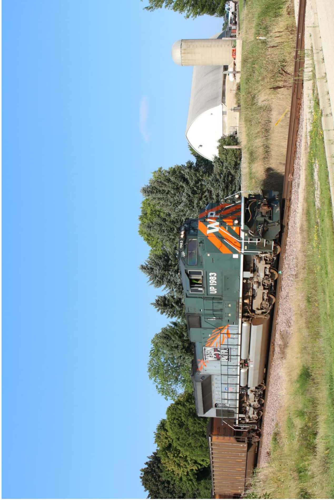
UP #1983 leads the Sheboygan coal train northbound at Maritime Road in Port Washington WI