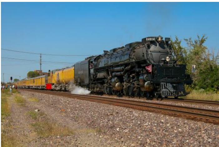
Chicago Heights IL on the Villa Grove Subdivision