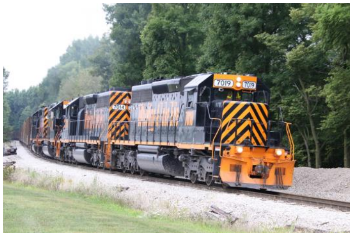
A matched set of 4 Wheeling and Lake Erie SD40-2 leads a rock train through Sycamore Ohio on August 18 2024

I joined Dan and Tara for a railfan trip August 19-22 2024. We investigated Ohio and Indiana area for shortline and regional railroads. We were successful. We saw the Wheeling and Lake Erie, Ohio Central and Louisville and Indiana railroads. Plus action from some of the class I railroads including CSX and NS. Below are some photos from the trip.